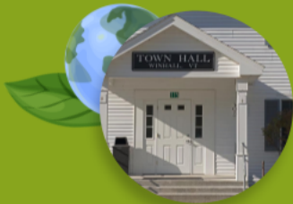
Town Hall / Police