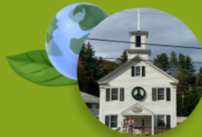
Community Arts Center